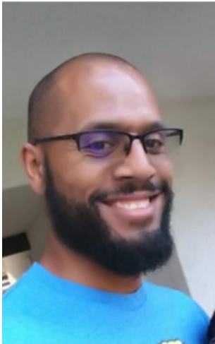
Facilitated by Tino Ratliff